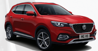
MG HS 1.5LT 7AT Core